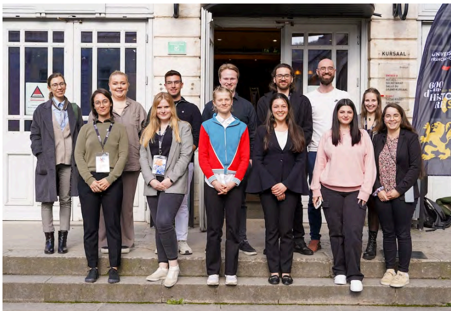
The current Student Board.

Our student board plays a pivotal role in shaping the future of the STARS European University. Comprising three students per partner institution, this board advises on education, research, and innovation initiatives. They are integral in developing joint activities and serve as ambassadors within the student community. Several universities have vacancies for the 2024-2025 academic year. If you know students that are interested in joining the STARS EU Student Board, they can email their motivation & C.V to starseu@org.hanze.nl to be sent onwards to the respective partners.